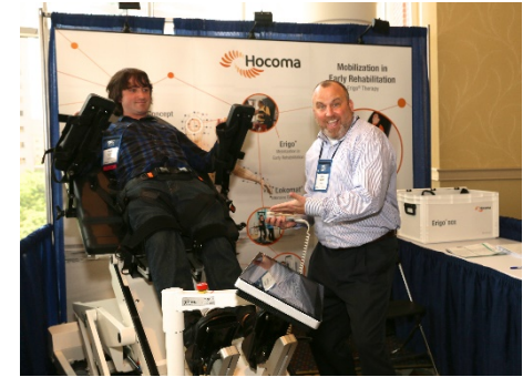
Premium Booth $3,500