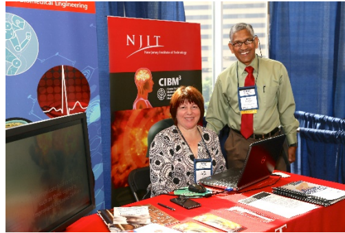
Standard Booth $2,500