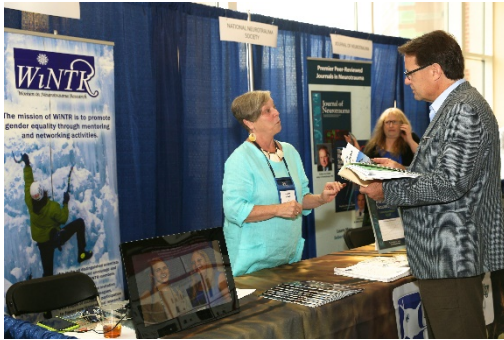
Non-Profit/University Booth $1,500