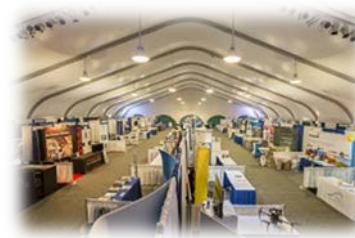
Exhibit Hours & Lunch

Set up your official booth in the morning, then mingle with attendees in the Cliff Lodge main lobby as they arrive in the afternoon.